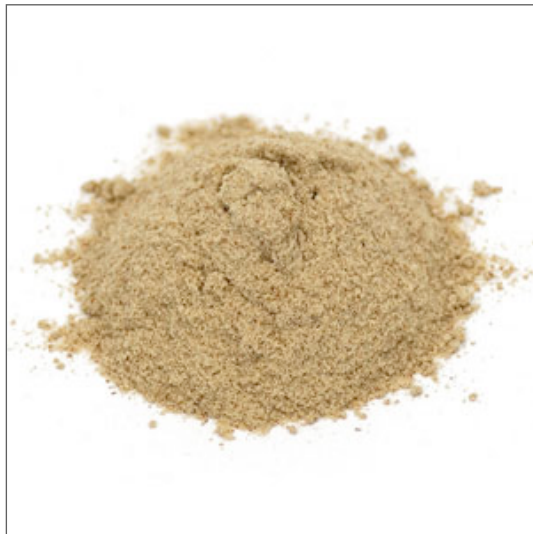
Quick Bowel cleanse powder

Made with the finest organic herbs and spices