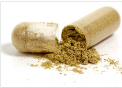
Quick Bowel cleanse Capsule

Made with the finest organic herbs and spices